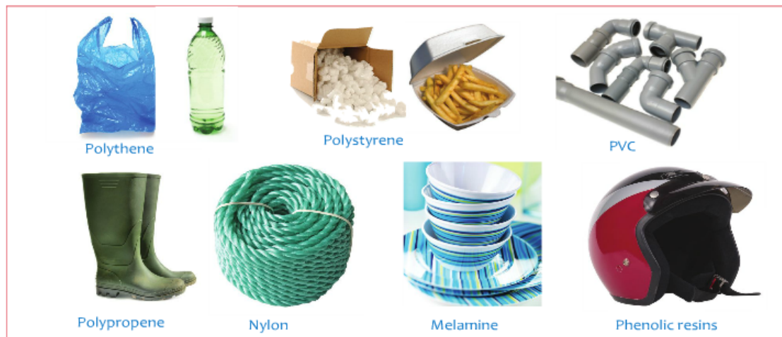
▲ Fig 30.1 Everyday plastics